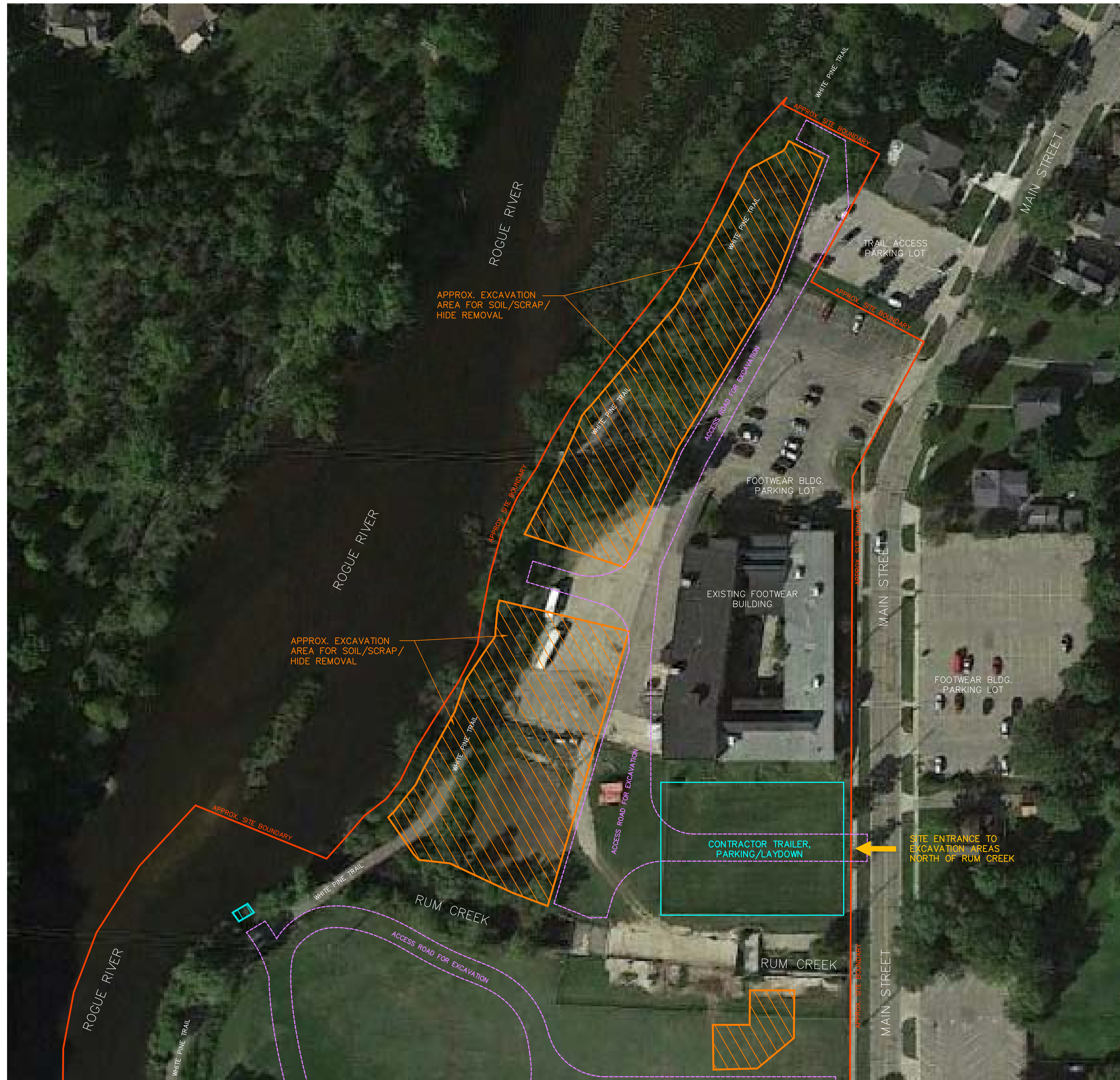
PARTIAL SITE PLAN (NORTH OF RUM CREEK) EXISTING FORMER TANNERY SITE BASE W/ CONTRACTOR LAYOUT